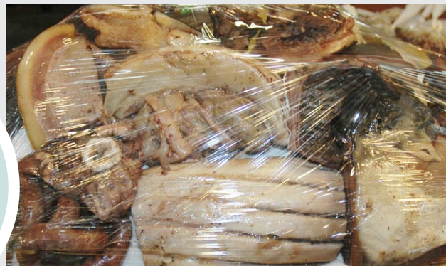
No Demand: Excess supplies of whale meat go unused.