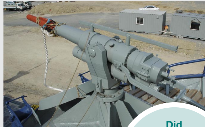
Killing Machine: a whaling harpoon at The Whale Museum in Ulsan, Korea

The main types of whaling conducted today are commercial whaling , aboriginal subsistence whaling and scientific whaling .