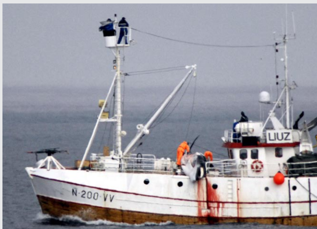
Painful death: Norwegian whaler "Brandsholmboen" and a harpooned Minke whale kill in Hamningberg.

In 2008 Japan set out to kill 1,415 great whales for 'scientific research'. The IWC believes the current lethal 'scientific' programmes are unnecessary and has called on Japan to stop this kind of whaling 15 times in the last 20 years.